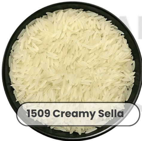
1509 Creamy Sella