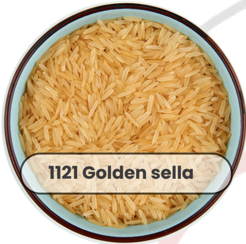
1121 Golden sella