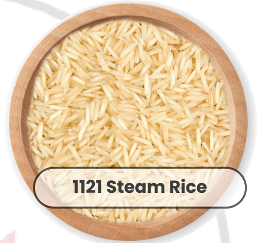
1121 Steam Rice