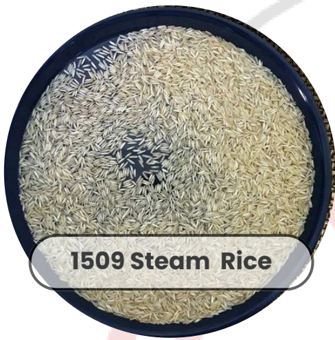
1509 Steam Rice