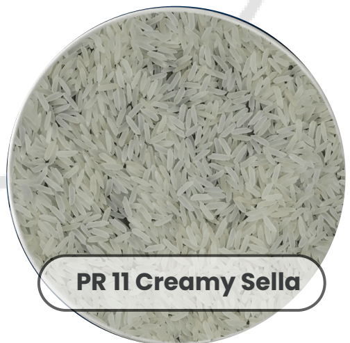
PR 11 Creamy Sella