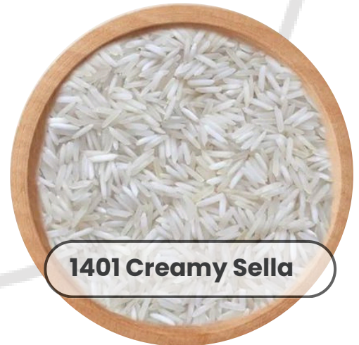
1401 Creamy Sella