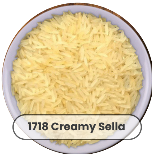
1718 Creamy Sella