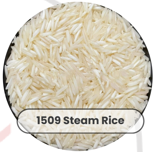
1509 Steam Rice